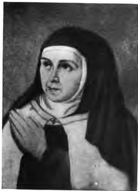
Saint Teresa (Teresa de Cepeda y Ahumada)